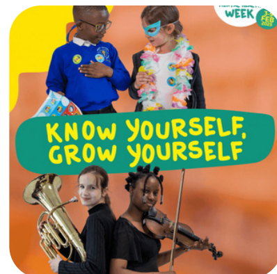
Childrens Mental Health Week