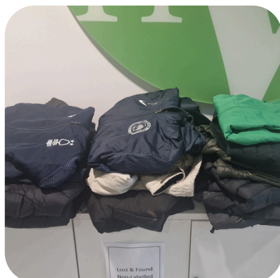
Coats in Reception