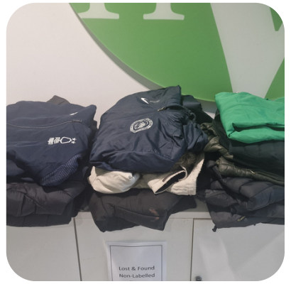
Coats in Reception