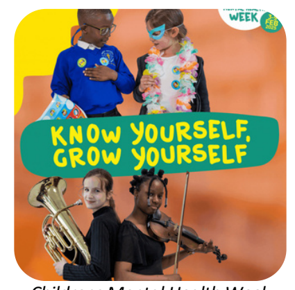
Childrens Mental Health Week